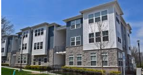
Examples of three-story buildings

If a three-story building is not feasible, a single-story building or buildings could be located on the site.