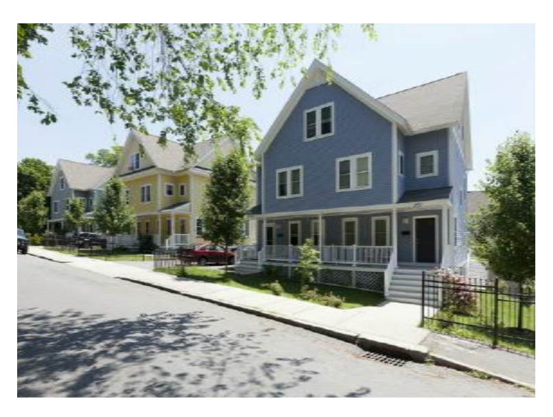
Example of a two-story duplex building

<u>Pleasant Street DPW site</u>: This is not part of the public housing properties but is town-owned. The DPW maintenance facility has been talked about for years; the recent town Master Plan process indicated support for promoting community housing on the site. The land is valuable and is located between a vibrant residential neighborhood and the Pleasant Grove cemetery. The site was included in the consultant's study to see if it could accommodate residential development and support redevelopment of the public housing properties.