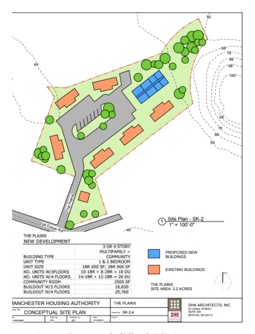
Site Plan showing a new three or four-story building in blue'