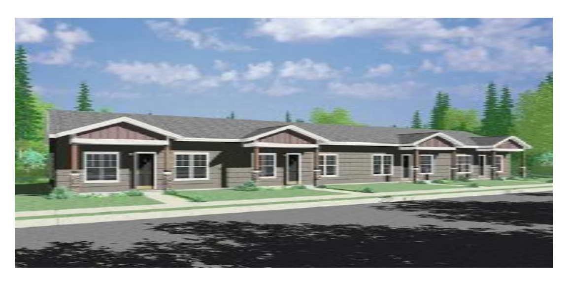
Example of a single-story row house building.

<u>The Plains</u>: The property is a 3.2-acre lot located in a residential neighborhood with a narrow frontage on Old Essex Road. The site contains six residential buildings dating from 1975 with a total of 48 one-bedroom units for seniors and the disabled. There is also a community building and a small maintenance building. The developed area is relatively flat. The buildings face an oval shaped vehicular driveway that has surface parking around a central green space. There is a small, undeveloped area on the northeast end of the site, behind the community building. It is a wooded area of about one-half acre that has a sloping topography with slopes ranging from 3% to 13%. The site is served by all utilities from Old Essex Road.