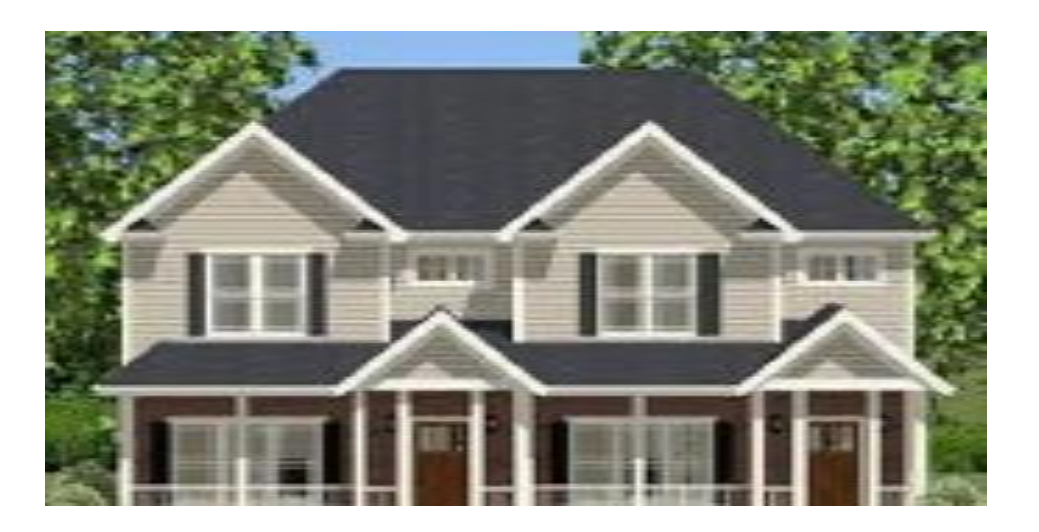
Example of two-story townhome building

Conclusion: The MHA and MAHT urge everyone to read the draft report – it can be accessed at Affordable Housing Trust - and hope that it will result in a productive discussion and town-supported development plan. We will soon outline and publicize opportunities for public engagement at meetings sponsored jointly by MHA and MAHT. At this time, however, it is important to remember that the vision is meant to be broad at this stage and is an attempt to simplify what will be a complicated project. It will unfold in phases, with different funding sources and perhaps different development partners. As it moves forward, it will undoubtedly change and adapt to the realities of funding and legal constraints, environmental and site limitations, specific design concepts from architects and engineers, and input from public housing residents, neighbors, and town officials.